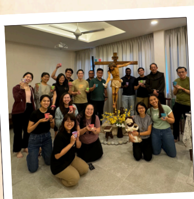
Franciscan Young Adults

Find out more about our fraternities and what we have achieved in 2024 in the next few pages!