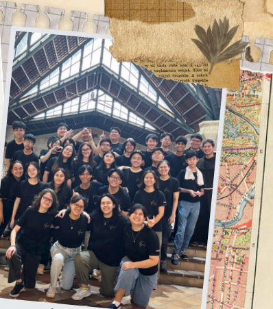
Minor Basilica of St Anne

As FY continues to grow, we pray that the fraternity continues to move in accordance to God's will. We seek to invite more youth to come and journey together in faith, friendship and discovery , as we continue living the Gospel through St Francis and St Clare.