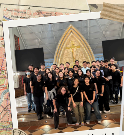
Church of the Holy Name of Mary

It was our hope that the youth would grow in their faith and discover God , through discovering themselves in unfamiliar and sometimes uncomfortable spaces, and God's providence was apparent through the participants' testimonies of great joy and faith following the mission trip .