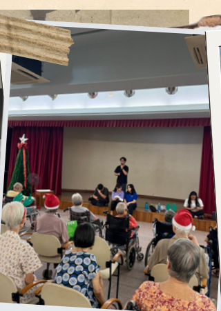
Little Sisters of the Poor