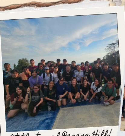
At the top of Penang Hill!